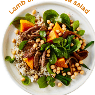
Lamb and chickpea salad

½ cup rice + ¾ cup chickpeas = 3 portions