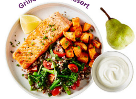
Grilled fish + dessert

¼ medium sweet potato + ½ cup cooked quinoa + 1 piece fruit + ½ cup yoghurt = 4 portions