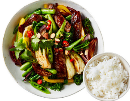
Beef Stir Fry