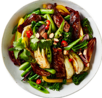
Beef Stir Fry