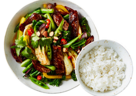
Beef Stir Fry